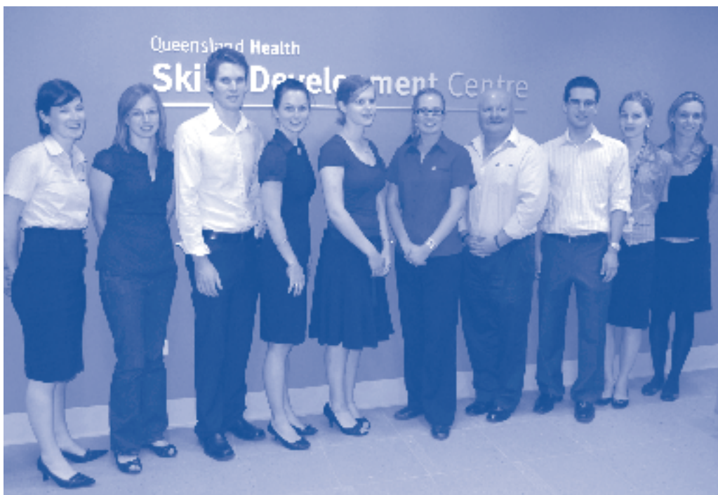
Pictured are medical radiation technology probationary registrants who participated in the presentation evening.